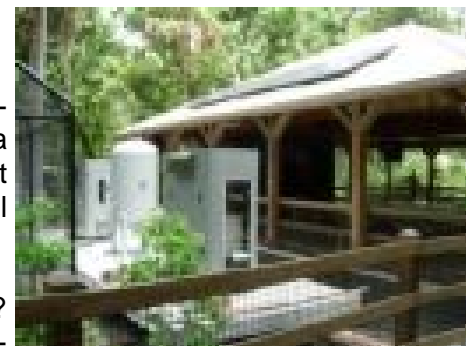
Fuel cell at Homosassa Springs State Wildlife Park

South Carolina – While you're visiting this beautiful state, take a ride on the Hydrogen Highway, a 59-mile route between Aiken and Columbia. Each city now has a hydrogen station – Aiken's station is used to fill fuel cell forklifts and will also support two hydrogen-powered internal combustion engine vehicles, while Columbia's will support a number of hydrogen projects planned by the city.