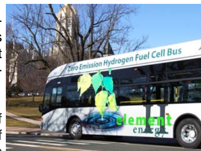
CTTransit's fuel cell bus

Ready for more education? Visit the Connecticut Science Center (Hartford), which features 150 hands-on exhibits, a state-of-the-art 3D digital theater, four educational labs, plus daily programs and events. The Center is installing a 200 kW fuel cell that will supply most of the power demand. Surplus electricity, generated at night when the Center's power demand is lower, will be sold the local power grid.