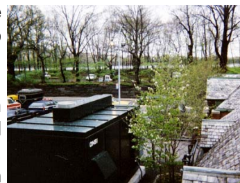
Central Park NYPD fuel cell

Everyone visiting New York has to spend some time in Central Park. Jog on by the Central Park Police Headquarters, where a 200 kW PAFC provides all the power for the station, completely independent of the electric grid. In fact, during that big, multi-state power outage in 2003, the fuel cell kept the station operating normally - the officers didn't even know the city's power was out until they looked outside.