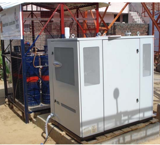
Plug Power GenSys system in India

Now, just a few years later, India is emerging as a key player in the fuel cell and hydrogen game. In 2008, India's Standing Committee on Emission Regulation approved the addition of up to 20 percent hydrogen to compressed natural gas (HCNG) for use in motor vehicles. And while there has been some research and development on the vehicle front with companies such as Tata Motors and Reva Electric Car Company Ltd., the country is mostly focusing on the telecommunications sector for the near future. The telecommunications and backup power market is a rapidly growing one for fuel cells. India has entered into several strategic agreements with fuel cell manufacturers for a market that is expected to grow with approximate addition of 50,000 towers annually in the country over the next three to five years.