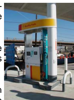
DC hydrogen Shell station

Delaware – If you're visiting Newark, stop by the University of Delaware and hop on board a fuel cell hybrid bus used on regular UD transit bus routes. There is another fuel cell bus at the Wilmington campus.