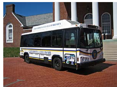
UofD fuel cell bus

Pennsylvania – Ready to go camping? Visit Parker Dam State Park and check out the Fuel Cell Pavilion. Here you'll see a 5 kW solid oxide fuel cell (SOFC) that provides heat to cabins and administration buildings and hot water for showers. Also note that the SOFC is fueled with natural gas derived from Pennsylvania forests.