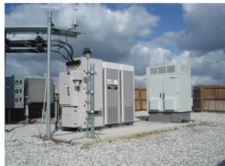
IdaTech unit in Florida—similar to model for India

IdaTech and Ballard are two other fuel cell manufacturers with sights on India. Back in October 2008, the companies entered into a supply agreement with ACME Telepower