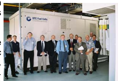
UTC fuel cell at Mohegan Sun

Connecticut – There is a lot going on, fuel cell-wise, in Connecticut. First, check into the Mohegan Sun (Uncasville) and visit the Casino's 400 kW fuel cell installation. Phosphoric acid fuel cell (PAFC) units are used to generate electricity for the entertainment complex, with waste heat recovered to preheat boiler feed water and generate domestic hot water. The indoor installation is open to the public, allowing visitors to view the fuel cells and learn about the benefits of the technology.