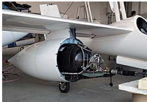
ELBASYS plane fueling up

The third phase of the ELBASYS project will demonstrate emissions-free ground operation, using four 12.5-kW fuel cells for ground taxiing of the Airbus A320 jumbo jet. Ground taxiing is usually performed by the main engines, but this project will instead use the fuel cell's power for operation of the nose wheel.