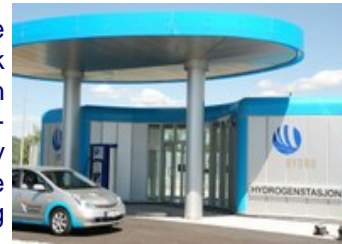
Norsk's Porsgrunn station

Finally, Norsk Hydro opened its first hydrogen station - the second hydrogen station in Denmark - in June near the Norsk Hydro Research Center in the city of Porsgrunn. The station will be part of a planned 360-mile Hydrogen Road located between Oslo and Stavanger. Nine Toyota Priuses, modified by Quantum Technologies to operate on hydrogen fuel, have been delivered to the site. Hydrogen for the station is being delivered via an undersea gas pipeline from a nearby petrochemicals plant, connecting the station directly to the source of by-product hydrogen production.