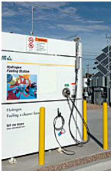
GTI's hydrogen station

In April 2007, the second hydrogen station in Nevada opened at the Las Vegas Valley Water District's main campus. The station generates hydrogen onsite, using solar-generated energy to drive the electrolysis generators. The station will be used to fuel several Water District vehicles that have been retrofitted to operate on hydrogen.