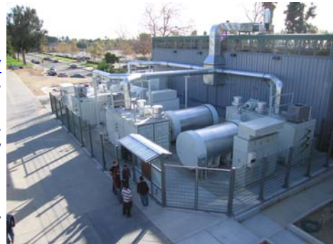
1-MW FuelCell Energy fuel cell

In the July/August issue of Distributed Energy Magazine , FuelCell Energy's California State University Northridge installation has made the cover. Inside, there is an in-depth article on the university's commitment to energy efficiency and 1-MW fuel cell installation.