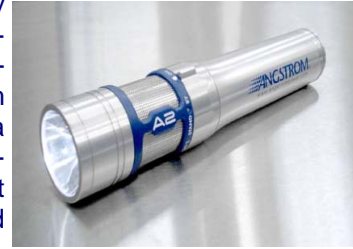
Angstrom's A2 fuel cell flashlight

For those late night trips to the bathroom, Angstrom Power released its A2 micro hydrogen fuel cell flashlight in 2006. The 1 watt LED flashlight runs on hydrogen stored in the handle and can run for over 24 hours on a single charge. You can buy the fuel cell-powered flashlight now and if needed, a larger version of the system could be integrated into other portable devices such as a two-way radio. For mountain bikers, Angstrom also has the micro hydrogen™ bike light. It can be affixed to a helmet or the handlebars and runs on a 21cc cartridge of hydrogen, equal to about 10 AA alkaline batteries. The light can last 20 hours between refueling, which can be done quickly, and you don't have to worry about recycling or disposing of numerous batteries on the trail.