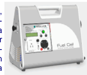
Voller's ABC fuel cell charger

Another company focusing on boating market is Voller Energy , based in the United Kingdom. Voller is currently developing a proton exchange membrane (PEM) fuel cell system that can run on a variety of fuels, including liquid petroleum gas (LPG), propane or butane. This product is designed for powering the 12V or 24V circuits onboard yachts, as well as in motor homes, and can even run on the cooking gas the stove uses. The system operates within a specified voltage range, switching itself on and off as the boat's power needs change.